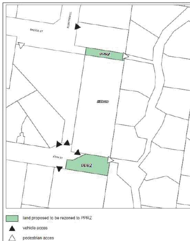
Figure 1 - Subject land and existing access

The part of the subject land at the eastern end of Bridge Street is currently being used as a pedestrian link through to Harlington Avenue. The part of the subject land at the eastern end of John Street is currently being used as a pedestrian link and informal vehicle access. Bollards were recently installed on part of this land to limit informal access.